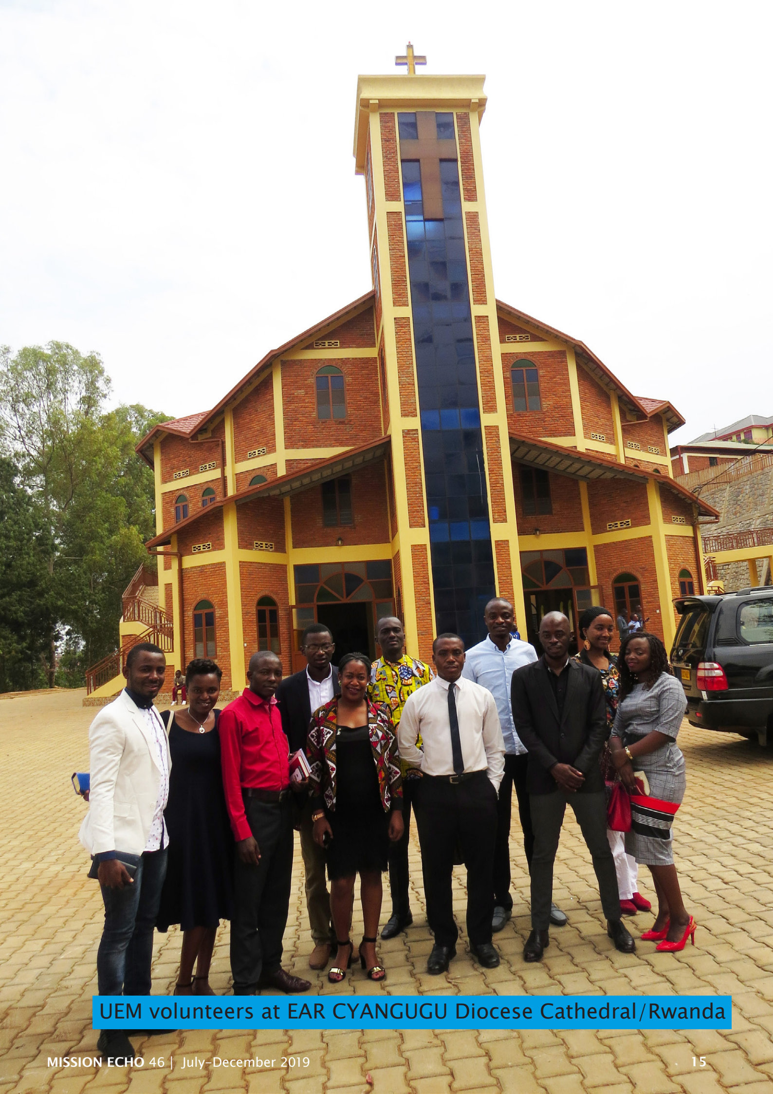
UEM volunteers at EAR CYANGUGU Diocese Cathedral/Rwanda