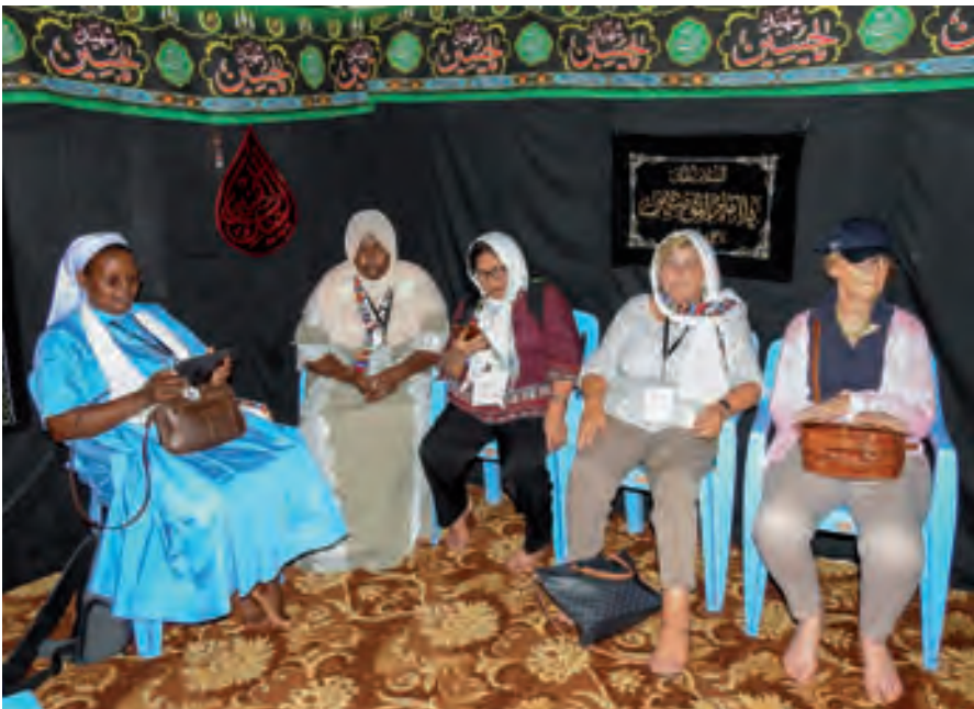
Exposure in Stone Town, Catholic Church (picture above) Exposure in Stone Town, Mosque