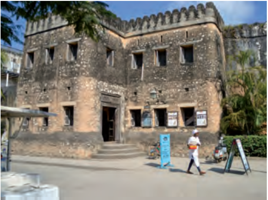
Zanzibar Old Fort