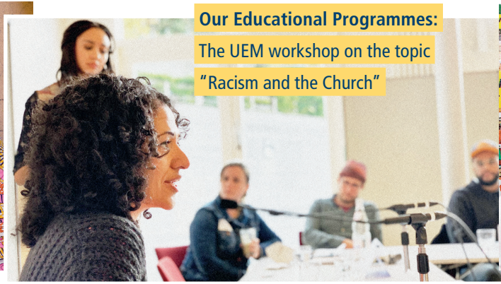
Our Educational Programmes: The UEM workshop on the topic "Racism and the Church"