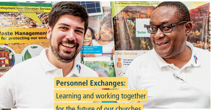
Personnel Exchanges: Learning and working together for the future of our churches